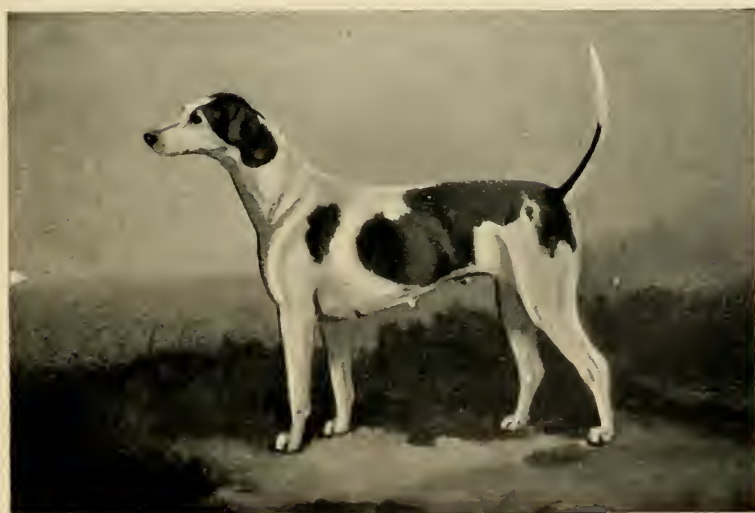
A BITCH HOUND